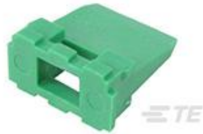
TE Part #W6P WEDGE LOCK, 6P, REC, GRN, DT