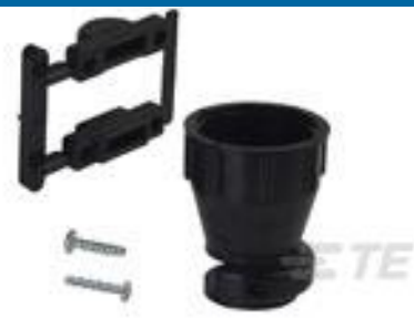
TE Part #206070-8 CABLE CLAMP KIT #17