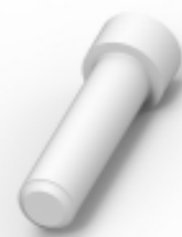
TE Part #114017-ZZ SEALING PLUG, SIZE 12/16, WHT