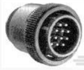
TE Part #206429-1 CPC PLUG ASSY, 11-4, REV SEX