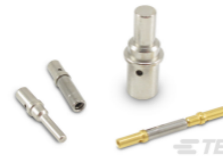
TE Part #0462-201-20141 DEUTSCH SOLID CONTACTS